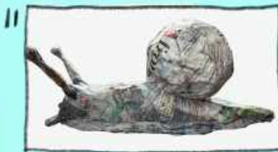
11 You can add the frill around it's foot (body).