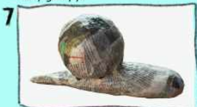
You will need a few layers over the whole surface to make sure it's strong. You may need to do this in stages to allow sections to dry. Once you've covered the base sit it on some plastic or a piece of newspaper, it will stick!