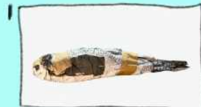
For the body - make a sausage shape from crumpled newspaper. Hold it together with tape.

1st YOU WILL NEED : Newspaper Wall paper paste or PVA glue Masking or paper tape 3 x Cocktail sticks