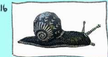
16 Can you use different marks and patterns to make it more interesting?