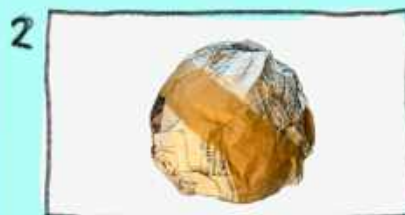
Make a ball of newspaper, this will be the shell. Attach it to the body with tape.