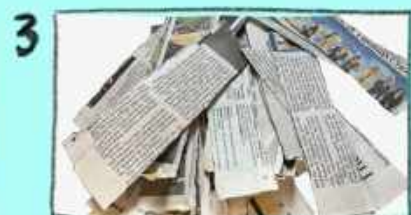
Now rip up lots and lots of pieces of newspaper!