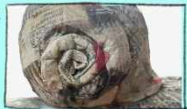
12 You can add the swirly spiral to the shell. Or anything else you'd like to? Once you're happy, leave it to dry.