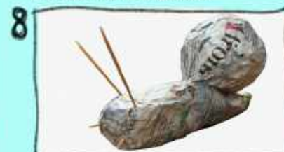
Once it's dry you can add the eye stalks. Break or cut your cocktail sticks to size but allow a bit extra! Now poke them into your snail where you want them.