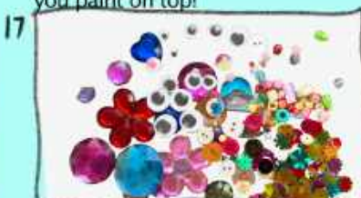
17 Will you jazz it up it by sticking bits and bobs on with glue? The only limit is your imagination! Go crazy and get sticking.