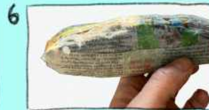
Cover your snail with gloopy paper. Make sure you overlap each piece so that it won't fall apart.