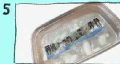
Now for the fun bit! dip one piece of newspaper into the paste, make sure it is covered with gloop.