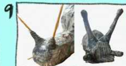
To secure and shape your eye stalks simply cover with more gloopy paper until you are happy with their shape. Don't forget to overlap onto the head of your snail.