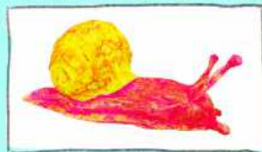
15 Is your snail going to be colourful? Or are you going to limit your colour palette to just a few colours?