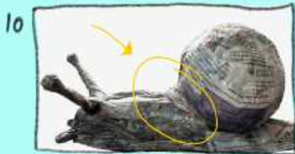
10 You can stop there or you can choose to add other details to the shape of your snail....