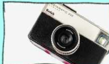
18 When you've finished, make sure you take a photograph of your snazzy snail and tag me in the pic. Send to @sarabudzikmaking Thank you!