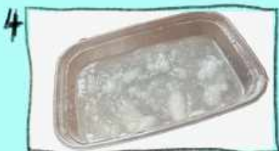
Then mix some wallpaper paste in a tub with a lid. It should be very gloopy!