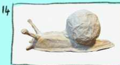
14 Or you can paint it! Start by painting it white - this will help your colours pop! Make sure this dries out before you paint on top!